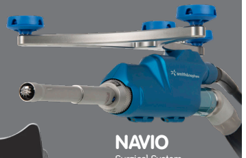
NAVIO Surgical System