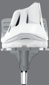
JOURNEY II CR Cruciate Retaining Knee System

Supporting healthcare professionals for over 150 years