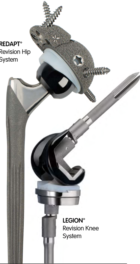
LEGION ® Revision Knee System

Smith & Nephew, Inc., 7135 Goodlett Farms Parkway, Cordova, TN 38016, USA Phone: 1-901-396-2121, Information: 1-800-821-5700, Orders/inquiries: 1-800-238-7538