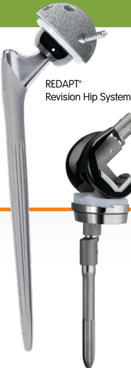
REDAPT® Revision Hip System