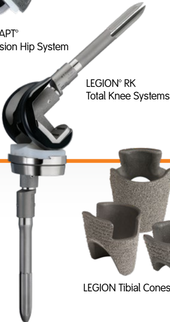
LEGION® RK Total Knee Systems